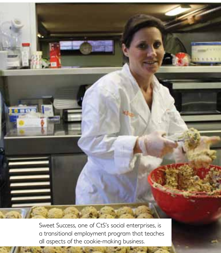
Sweet Success, one of CtS's social enterprises, is a transitional employment program that teaches all aspects of the cookie-making business.

while earning an hourly wage and building a resume. The entity came about through a CtS volunteer who had closed her catering business.